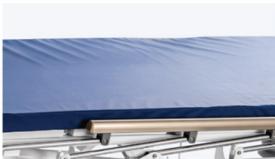
Waterproof PU mattress, convenient for transfer patient

TPR tire no worn out after running 30KM, save anti-winding hard shell, united forming without bolts