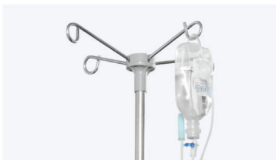
Full SS IV pole, bearing 15kg