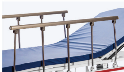
Foldable aluminium alloy guardrail