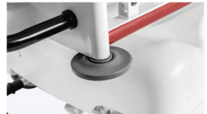
Bumper wheel detachable, max. protect the bed and patient during transportation