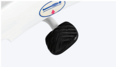
Hydraulic treadle for rise