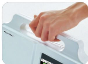
Compact, portable design