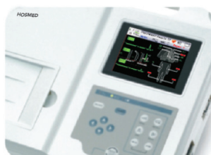
Simple interface display, easy for operation