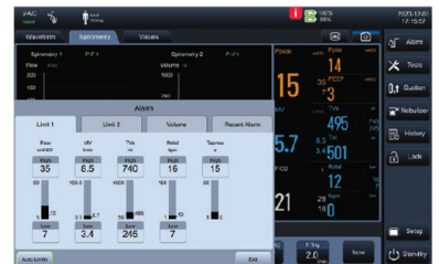
Alarm Limit Interface